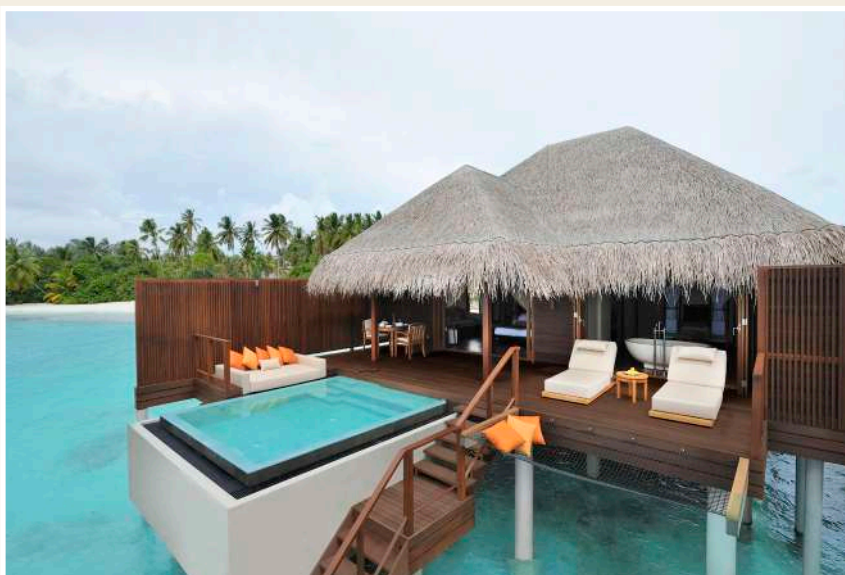
Total Area : 108 sqm Max. Occupancy : 3 Adults + 1 Infant (Baby Cot) or 2 Adults + 2 Children

Positioned over the turquoise lagoon, these over-the-water villas offer an idyllic setting for relaxing and contemplation. Lounge on the ocean hammocks and allow the gentle lapping of the waves to soothe you. These spacious villas offer a private outdoor veranda, sun loungers, ocean hammocks, plunge pool, direct lagoon access and an uninterrupted view of the horizon.