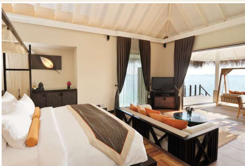
Total Area : 156 sqm Max. Occupancy : 3 Adults + 1 Infant (Baby Cot) or 2 Adults + 2 Children

Perched on the beach with an outdoor terrace over the water and the unique feature of entering from the beach and exiting from the ocean if desired; these spacious suites comprise a large living and bedroom area complete with an expansive outdoor veranda. Plush swing sofas, sun loungers and plunge pool with Jacuzzi further enhance the tranquil setting with direct lagoon access from the terrace.